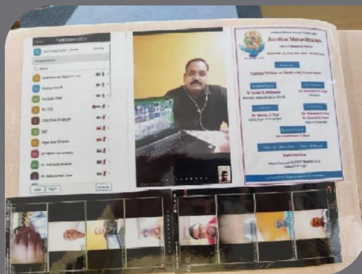
Department Organize National Level Webinar