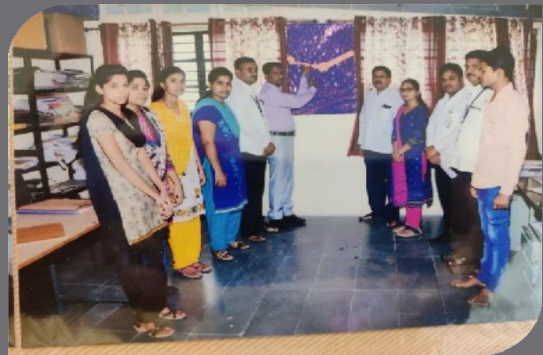
‘Disha’ Wall Paper Inauguration programme and Natural Calamity wallpaper presentation .